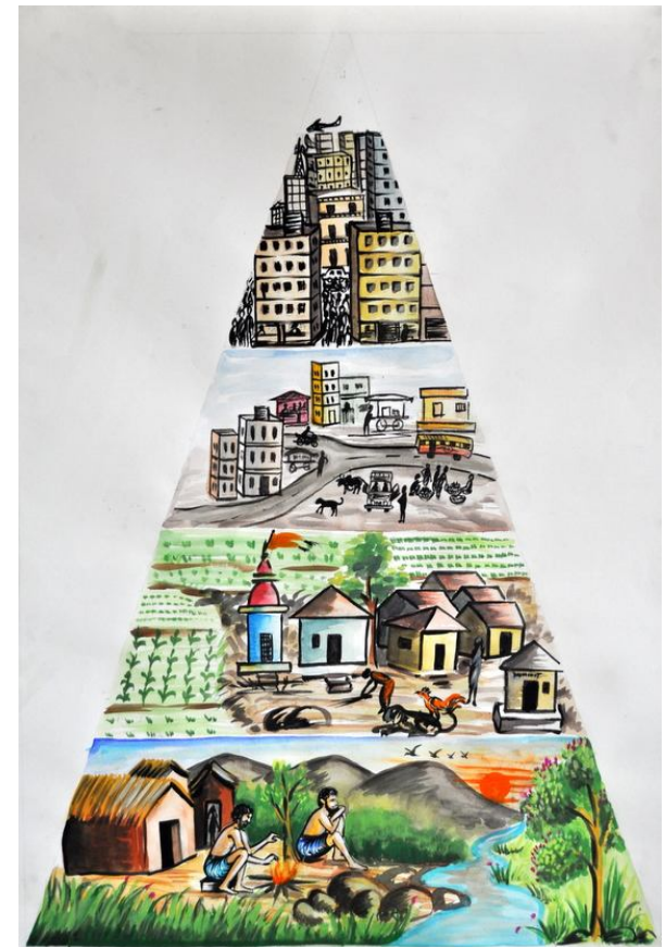
Under Threat from Climate Change and Resource Depletion

Human Ecological Pyramid: Megacities dependent on Rural Ecosystems and Forests