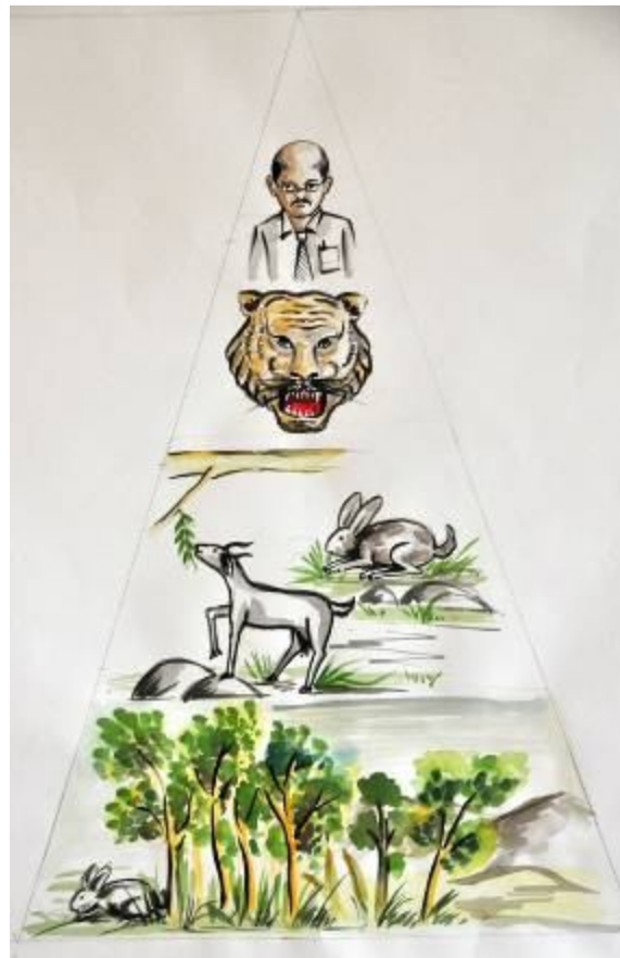
Human Being the Most Vulnerable

Revised Ecological Pyramid: Shifting Paradigms