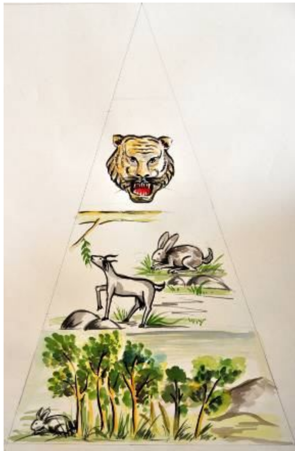
Tiger at the top of the Pyramid

Ecological Pyramid: Partial Truth Distorting the Reality